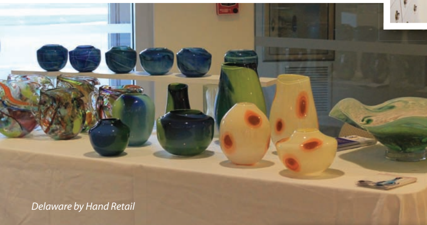
Delaware by Hand Retail