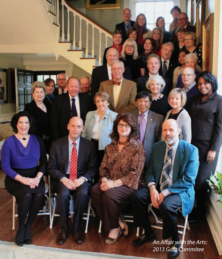
An Affair with the Arts: 2013 Gala Committee