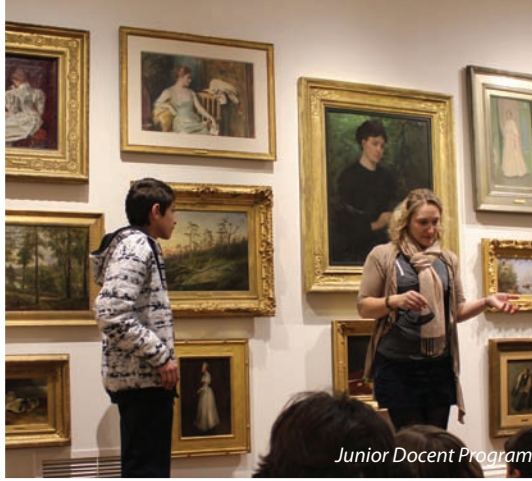
Junior Docent Program