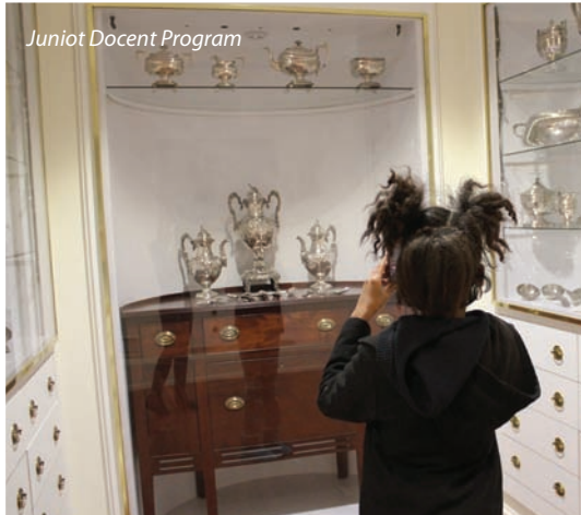
Juniot Docent Program