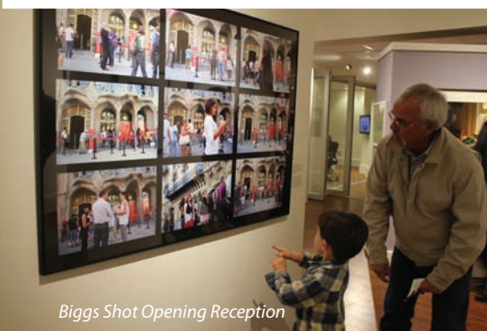
Biggs Shot Opening Reception