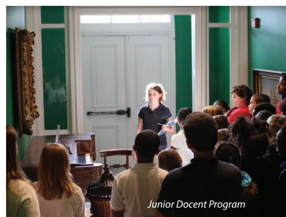
Junior Docent Program