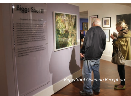
Biggs Shot Opening Reception